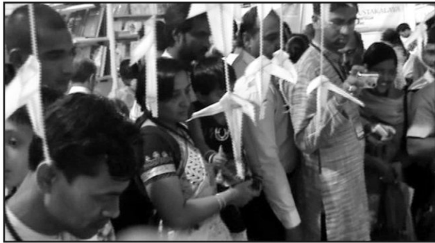
Visitors at Bangalore Fair

At Bangalore, the event was World Samskrita Book Fair, held from Jan 7-10, 2011. On the third day of the fair, the organizers - Samskrita Bharathi asked us to vacate. The