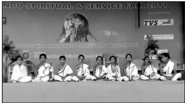
Chennai Hindu Fair

At Chennai, there was no such conflict! The event was Hindu Spiritual & Service Fair that was held from Jan 26-30, 2011. This fair was meant to publicize the